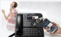
One touch "Call Move" between deskphone and smart devices