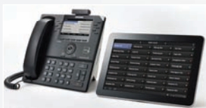
Smart Add-on-Modules (AOM) using smartphones and tablets (devices are sold separately)